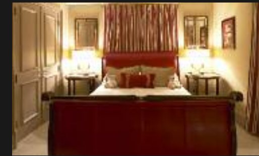
Old Course view room